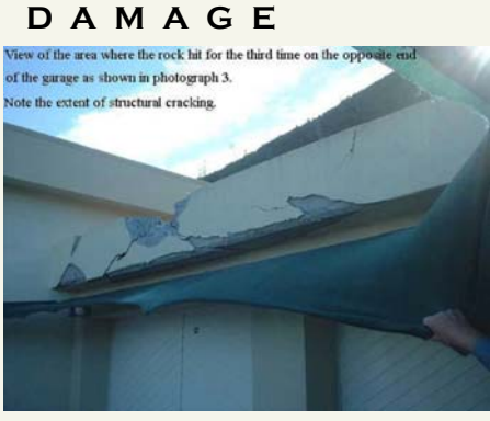
View of the area where the rock hit for the third time. Note the effect of structural cracking