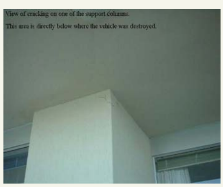
View of cracking on one of the support columns. This area is directly below where the vehicle was destroyed.