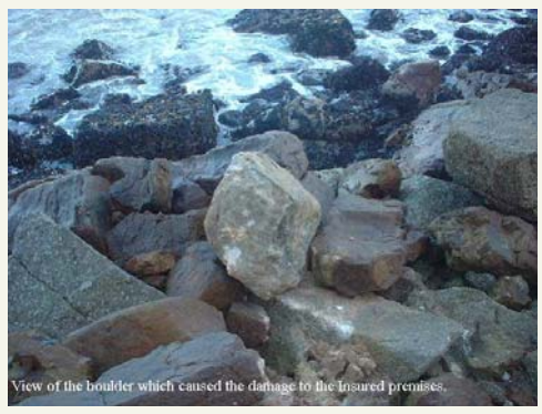
View of the boulder that causes the damaged to the insured premises.