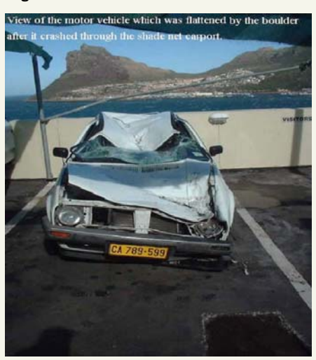
View of the vehicle that was flattened by the boulder after it crashed through the shade net carport.