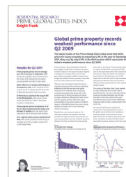
Prime Global Cities Index Q3 2011