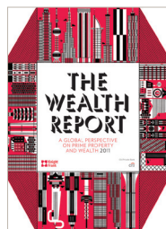
The Wealth Report 2011