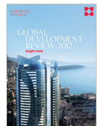
Global Development Review 2012

Knight Frank Research Reports are available at www.KnightFrank.com/Research