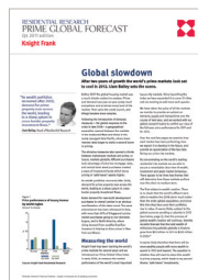
Prime Global Forecast Q4 2011