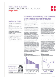
Prime Global Rental Index Q3 2011