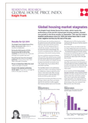
Global House Price Index Q3 2011