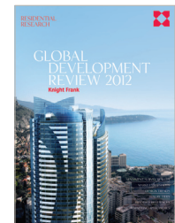
Global Development Review 2012

Knight Frank Research Reports are available at www.KnightFrank.com/Research