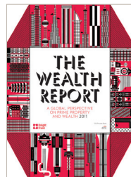
The Wealth Report 2011