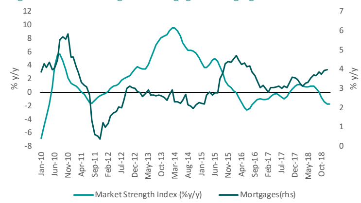
Figure 3: Market strength vs Mortgages: Diverging trends

That said, the prevailing macroeconomic fundamentals point to a muted property market in the near term, with house prices confined within the 3.5% to 4.5% range, against our average annual inflation forecast of 4.7% in 2019. Much will hinge on the evolution of the broader economic fundamentals, particularly employment growth, and whether the current consumer reticence lifts after elections.