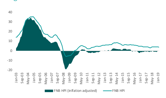
Figure 1: FNB HPI