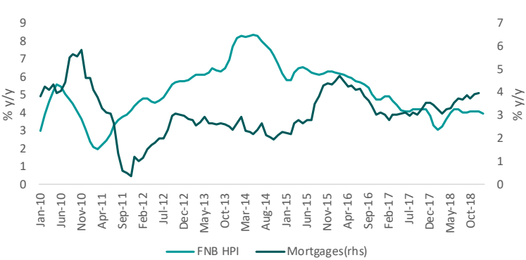
Figure 5: FNB HPI vs Mortgages