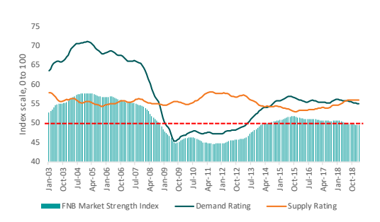
Figure 2: FNB Market Strength Index